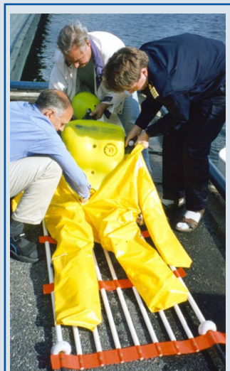
The Dacon Rescue Dummy - fitting the PVC