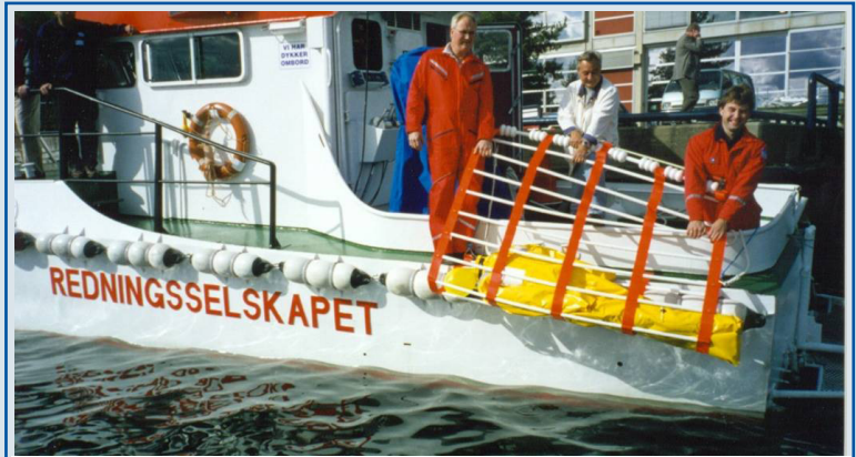
Recovery of the Dacon Rescue Dummy using the Dacon Rescue Frame

The Dacon Rescue Dummy is extremely robust and will take severe abuse. It may be dropped in the water from any realistic height from vessel, rig or helicopter and may be handled in just about any manner.