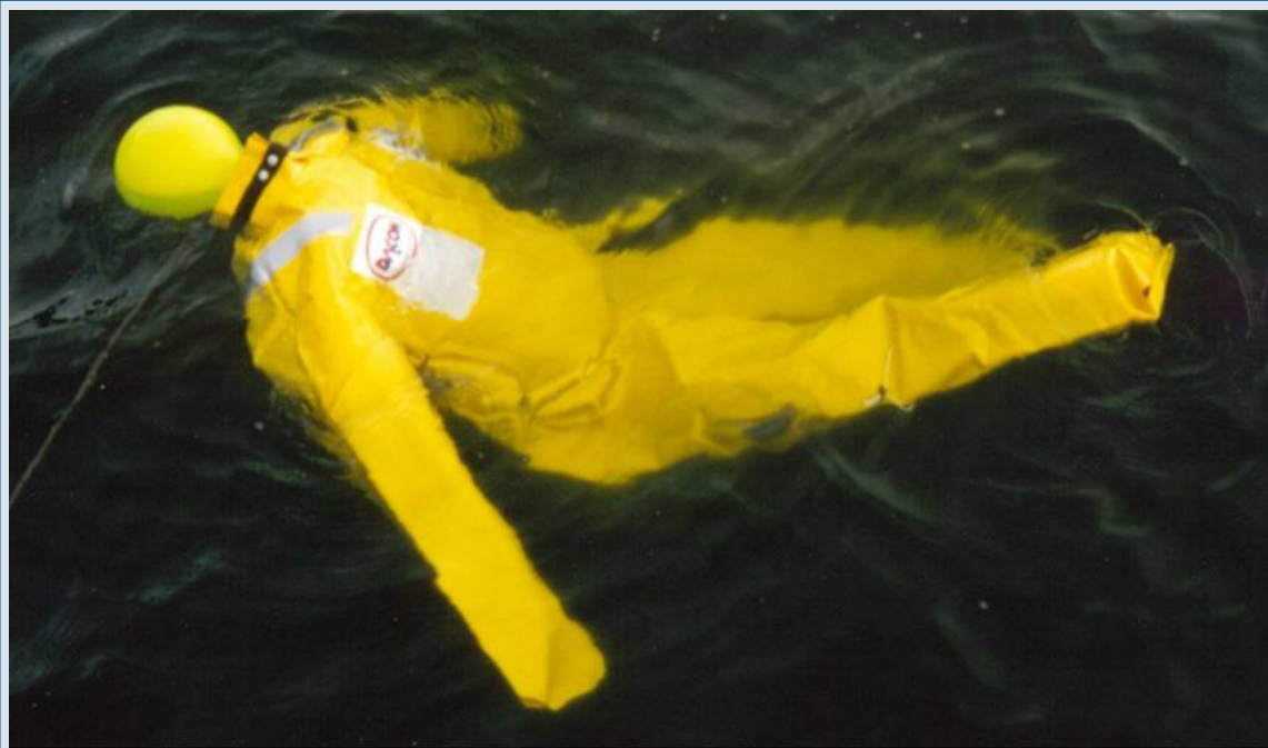
Dacon Rescue Dummy - adjusted for horizontal floating position

The Most Robust and Versatile Exercise Dummy Available!