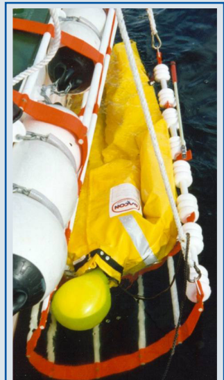
The Dacon Rescue Frame