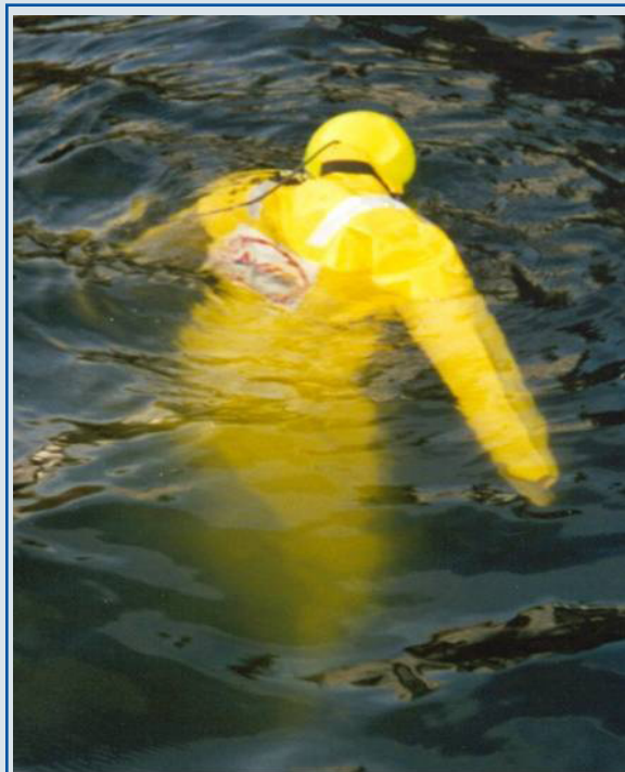
Dacon Rescue Dummy - adjusted for vertical floating position